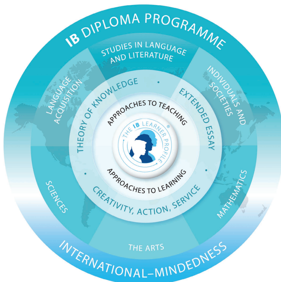
Figure 1 Diploma Programme model

The course is presented as six academic areas enclosing a central core (see figure 1). It encourages the concurrent study of a broad range of academic areas. Students study: two modern languages (or a modern language and a classical language); a humanities or social science subject; an experimental science; mathematics; one of the creative arts. It is this comprehensive range of subjects that makes the Diploma Programme a demanding course of study designed to prepare students effectively for university entrance. In each of the academic areas students have flexibility in making their choices, which means they can choose subjects that particularly interest them and that they may wish to study further at university.